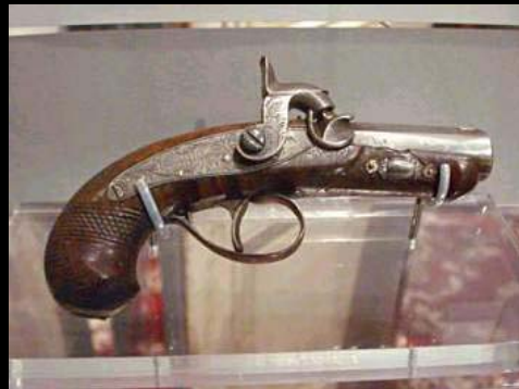
GUN USED IN LINCOLN'S ASSASSINATION