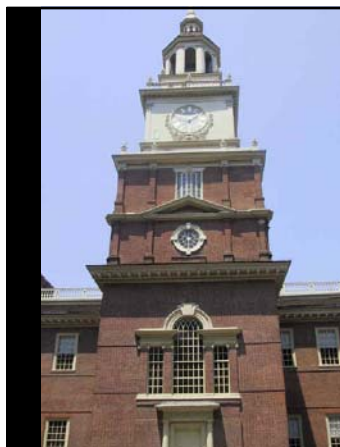
INDEPENDENCE HALL IN PHILADELPHIA